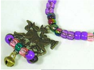
Safe Journey Pendant example (P)